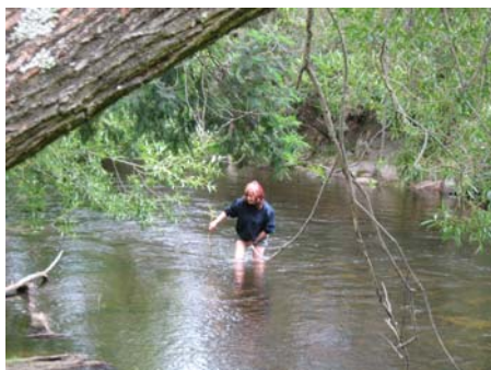
Who’s that in the river!!