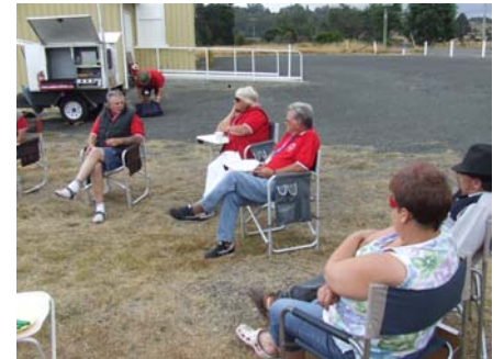
Happy Hour - enjoyed by all