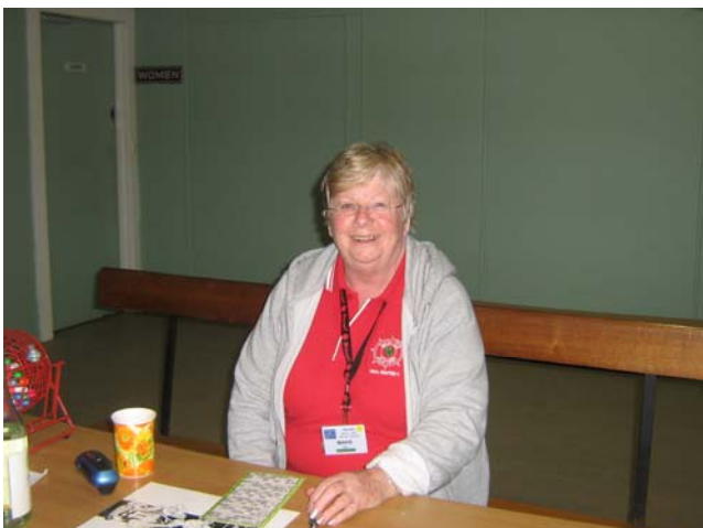
The “boss” overseeing the “ball chaser”