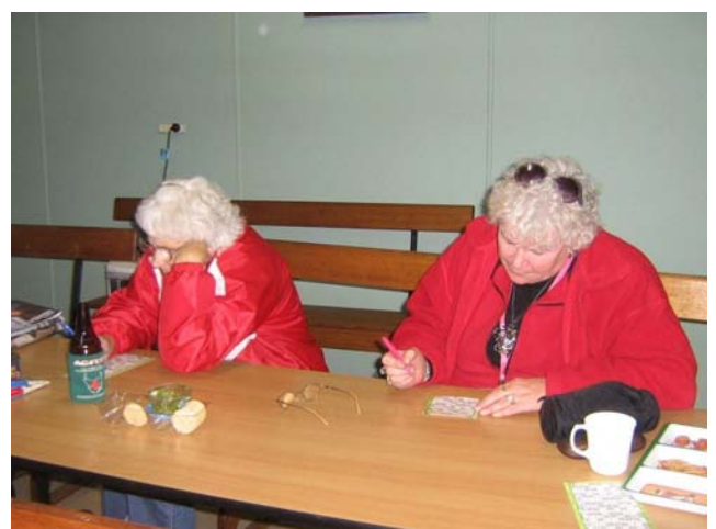
Heads down!! - and it's “legs eleven” - total concentration