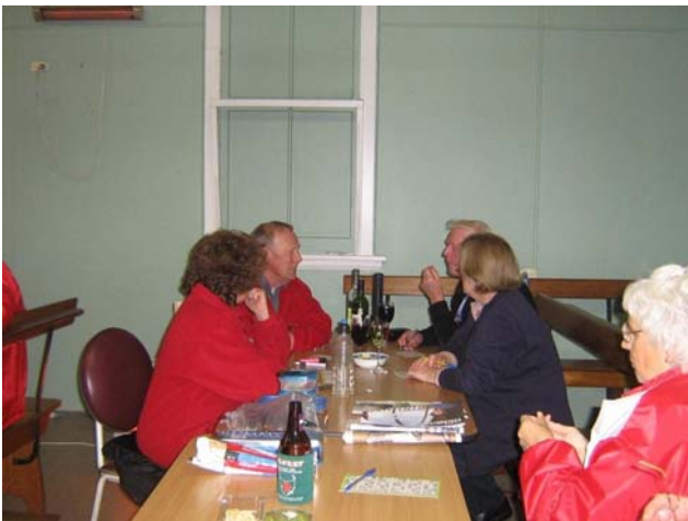
Now here we go again - let's see if we can beat that other table

Personal locating beacon:- Don raised his concerns over sometimes our inability (especially when we are at sites where there is no mobile phone reception, Myrtle Park, Chain of Lagoons, Bellingham etc) to raise a request for “medical support”- ambulance etc). The committee discussed the concerns and it was unanimous that we should purchase an “Eperb” type beacon ASAP and that it be put to the membership after the meeting. Membership totally supported the suggestion and sanctioned an immediate (or as soon as possible) purchase up to $450 of a beacon, Barry W & Jim R to finalized)