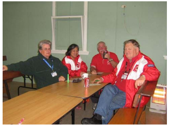
Red tops fairly prominent - a group enjoying themselves!!