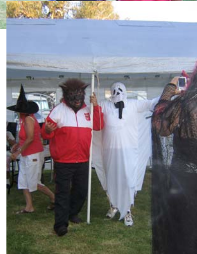
Best costume-"Fairy Pete"