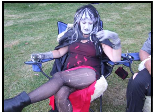
The “keeper of the books” - dressed up to kill - one of our two hosts getting into the mood