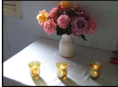
"The Candles" - introduced 2006