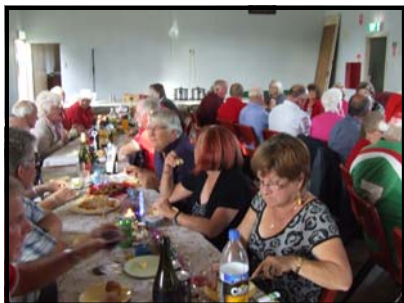
"Togetherness" for an evening meal