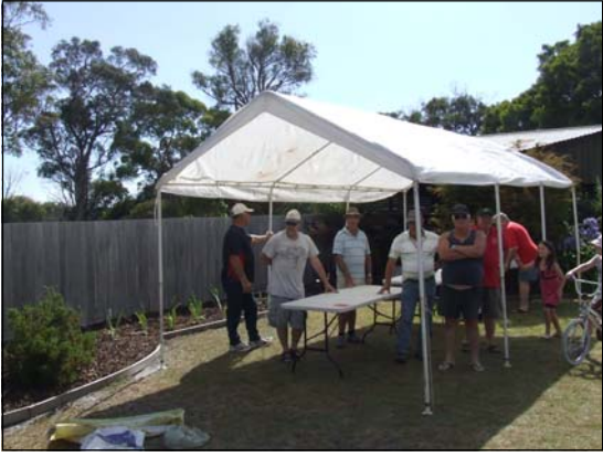
DD's construction crew.