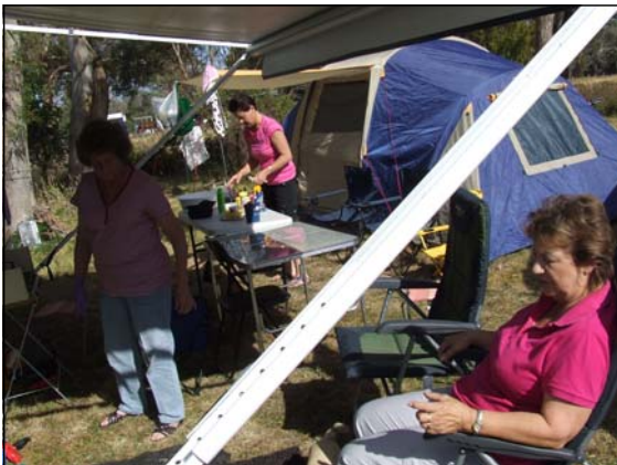
“The Rigby Clan”