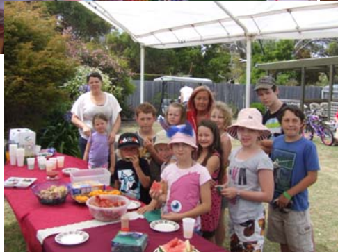
Our younger Crew Ready to party on!!