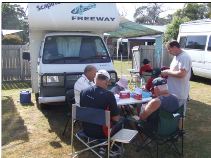
Raffle ticket preparation at Bridport for Feb TCCR