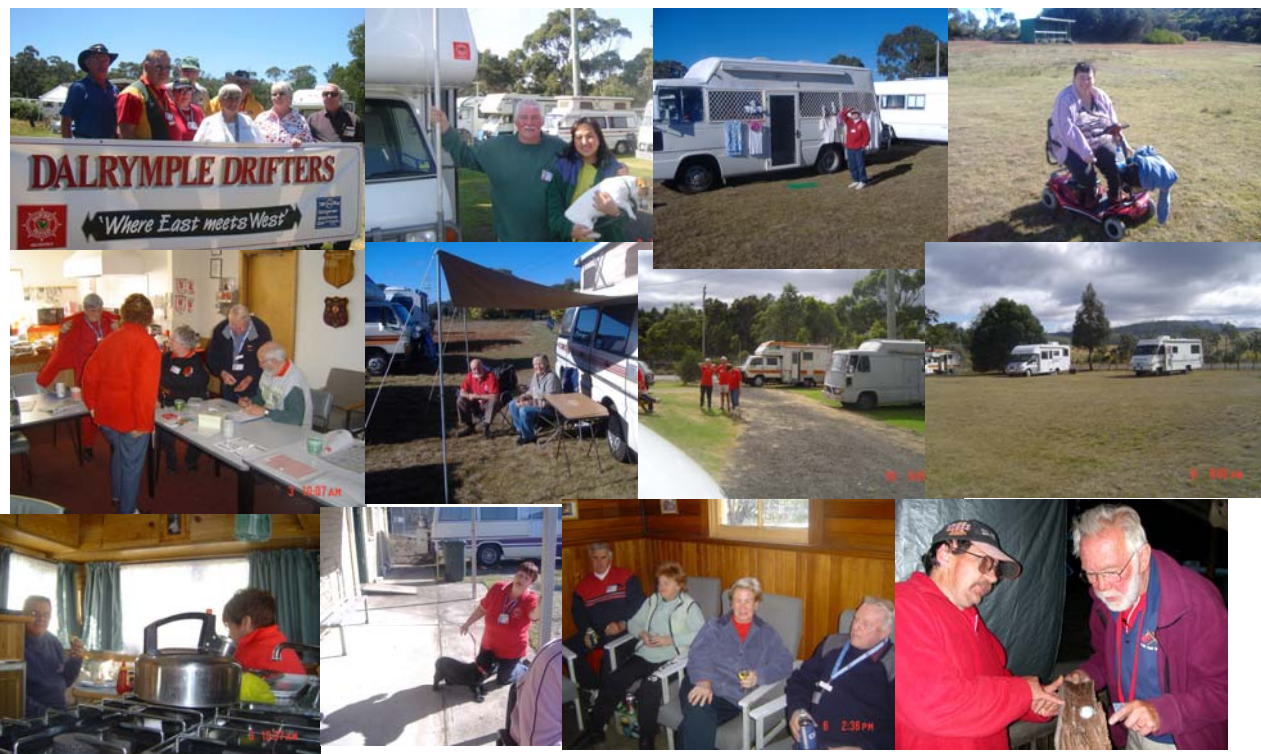
Some flash backs to 2006 at our Dalrymple Drifters Chapter rallies