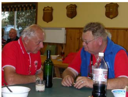
Serious discussion? - no not really!!